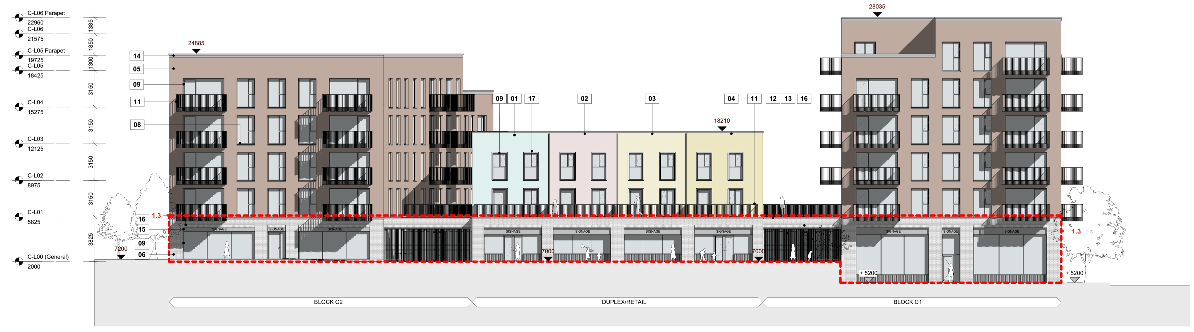
South Elevation 1 : 200