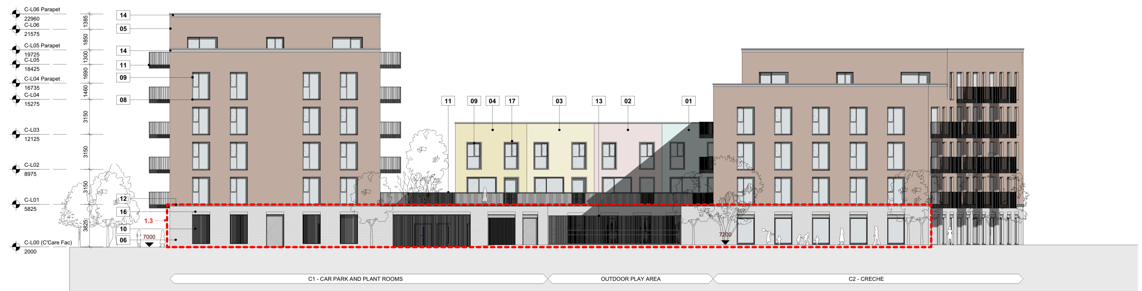
North Elevation 1 : 200